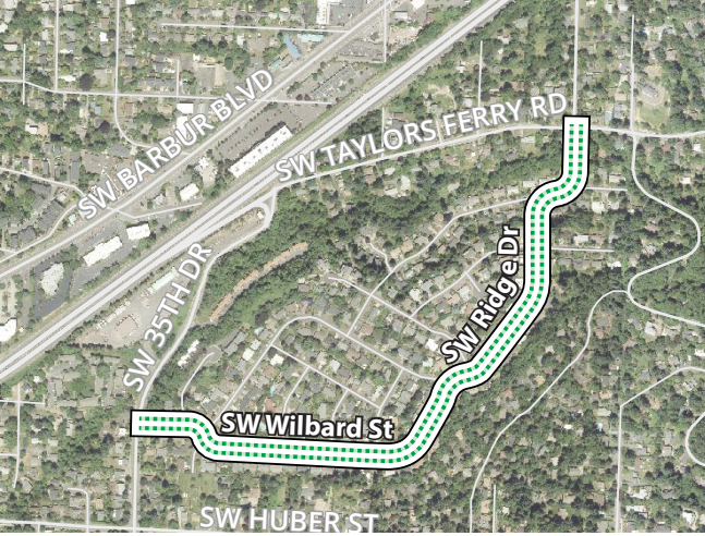
Proposed Neighborhood Greenway